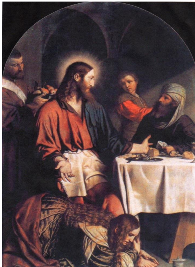
Jesus at Supper with Simon the Pharisee

August 23 rd A.D. 2015 Twelfth Sunday After Trinity