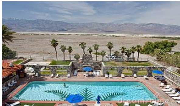
Guest house Facilities at Our Lady of the Dusty Desert – Kalahari, South Africa (from their postcard!)