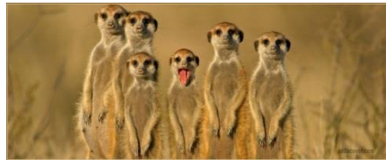
The community at Our Lady of the Dusty Desert Monastery