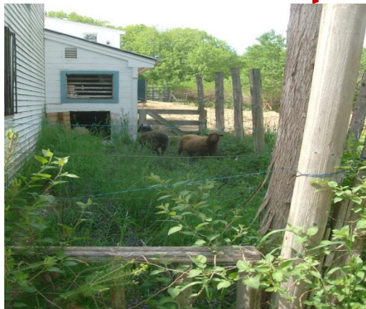
The sheep don't seem to be sure what to make of all the tall grass in one of their pastures!