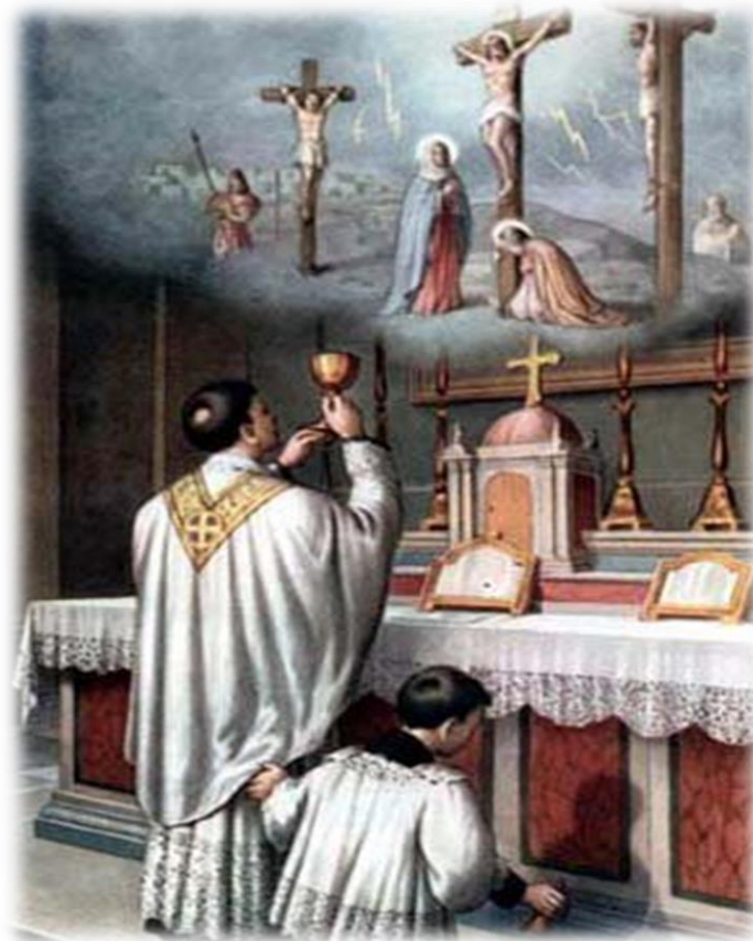
The Most Holy Sacrament of the Eucharist an early 20 th century Holy Card