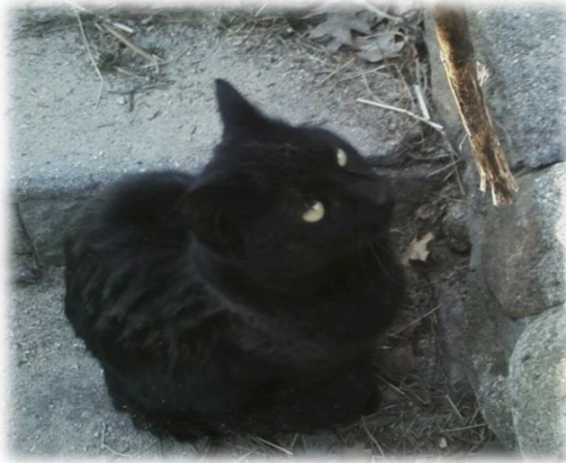
A new friend - Black Jack