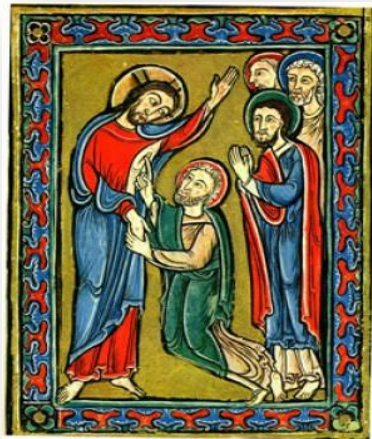
Medieval Greek icon showing Thomas with Jesus and the Apostles

PLEASE NOTE: Sunday Public Mass will resume in the Spring when temperatures permit. We will post the date of our first Mass in the Meditation.