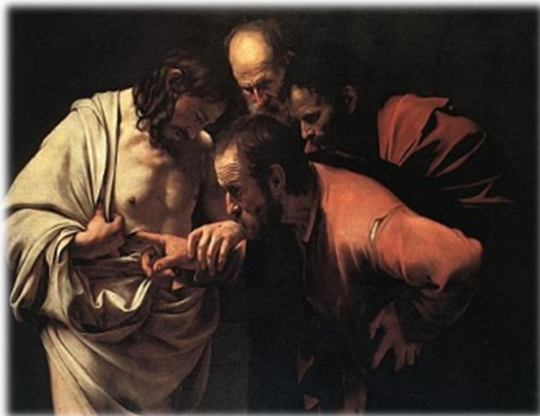
“The Incredulity of St. Thomas” ( 1601-1602) Michelangelo Merisi da Caravaggio 1571 – 1610 – Italian Baroque painter